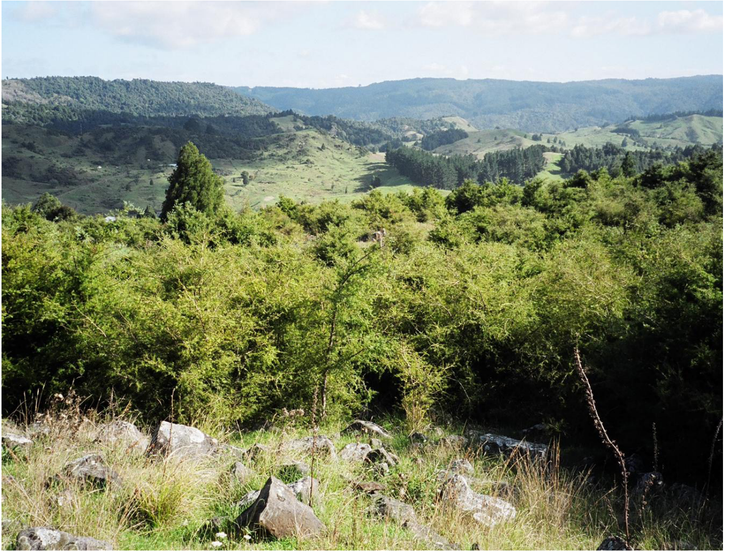
Natural regrowth totara in Northland

Manufactured tōtara products can include wall and ceiling linings, carved gifts, household items and souvenirs. These can also be made in Northland using wood processing and kiln dried cost-effectively at existing commercial sawmills and factories.